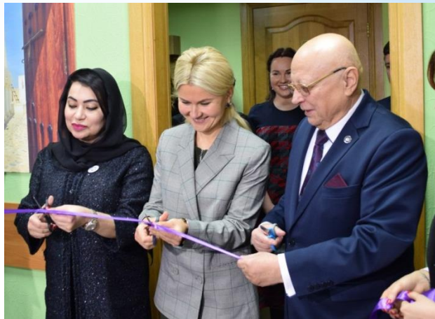
The Arabic Language Learning Center opening